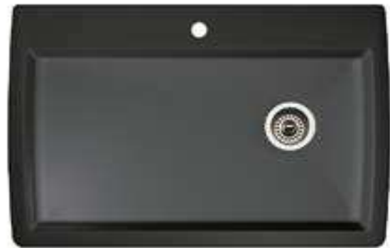
Model 440194 shown